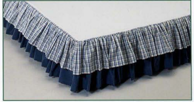
DOUBLE TIER SHIRRED