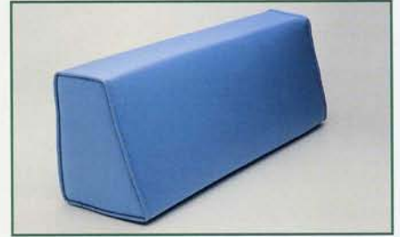
WEDGE 5" x 9" x 12" x width