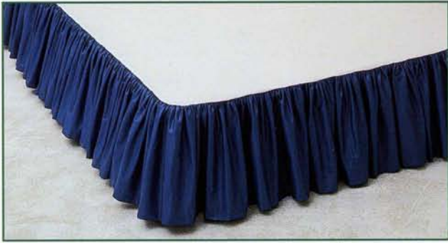
SHIRRED—Fabricated with a 2½ to 1 fullness