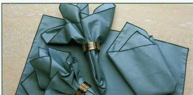
NAPKINS 17" Square Merrow Edge