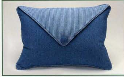
ENVELOPE FACE CORD EDGE