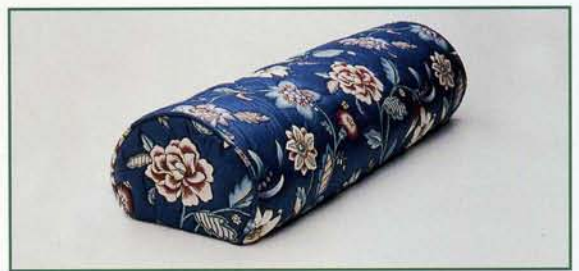
OVAL 8½" x 12" x width