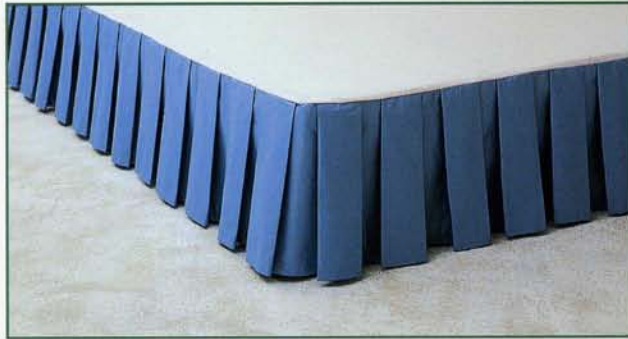
2 ¾" SPACED BOX PLEAT