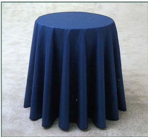
Table covers and table toppers are available lined or unlined. Options include a corded or ruffled hem.