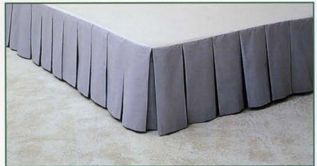
6" BOX PLEAT