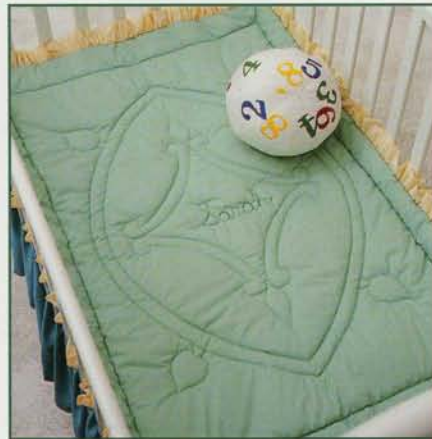
GRANDMA'S FAVORITE COMFORTER - Ruffled edge with quilted monogram. Ball pillow