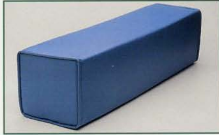
SQUARE 9" x width