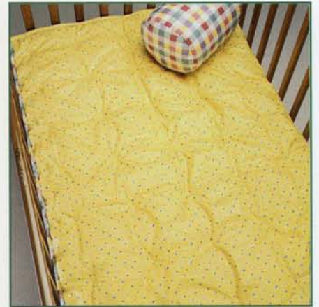
MOCK FRENCH KNOT COMFORTER - Corded edge Foam and polyester filled drum