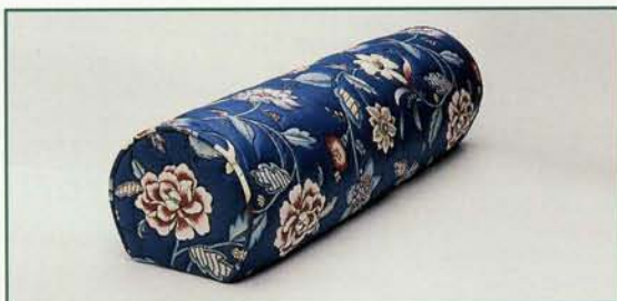
ROUND 10" x width

Upholstered bolsters are decorative, non-weight supporting. They are constructed with plywood ends, 1" x 1" support and a chipboard covering. The bottom is open for the placement of pillows.