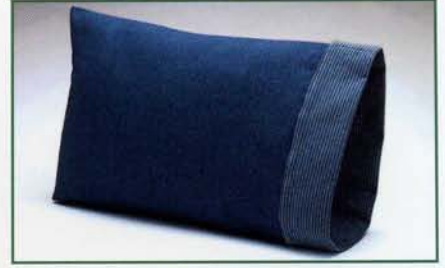
PILLOW CASE CONTRAST CUFF