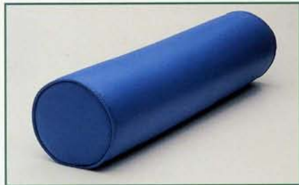
ROUND 9" x width Can have any of the same end treatments as the neck rolls in Section 4

Quiltmaster bolsters have a foam core and a polyester fiberfill wrap. They are available quilted or unquilted and have corded edges as pictured. The standard width is 37", however, they can be made any size.