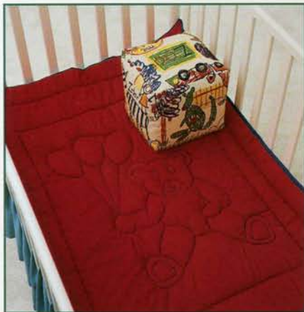
PARTY BEAR COMFORTER - Bound edge Foam and polyester filled cube

Crib comforters —In addition to the patterns shown below, you may select any quilting pattern from Section 2. A bound edge is standard. Options include cord or ruffle.