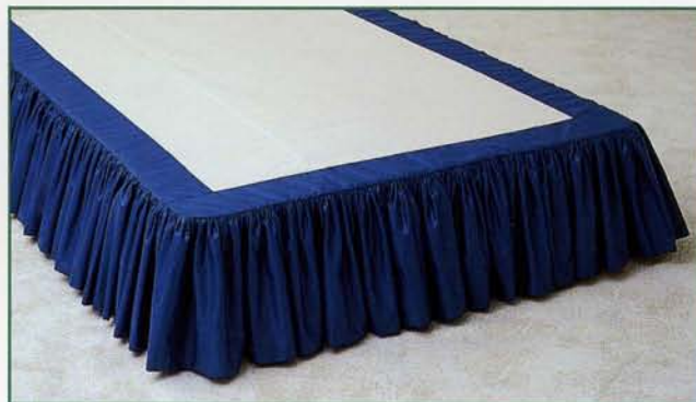
DELUXE (LINED) DUST RUFFLE

Styles: Eight styles are pictured on page 23. If you desire a style not shown, please submit a sketch or photograph for yardage and price quote.