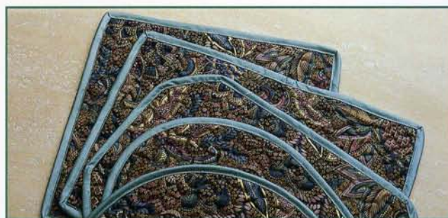
QUILTED PLACEMATS 16" Round, Square 12" x 18" Oval, Rectangle, Diagonal Corner