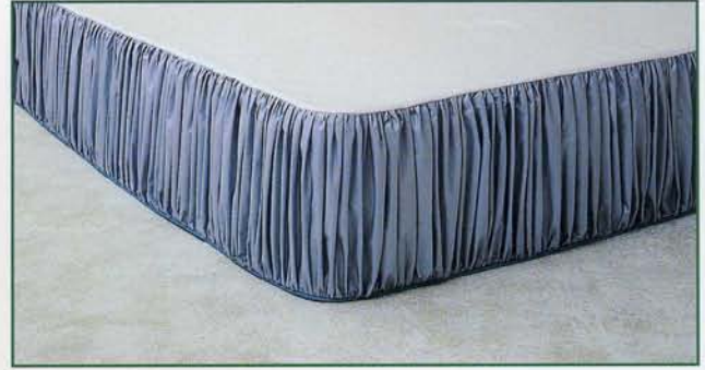
SHIRRED CORDED BOTTOM